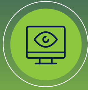
SECURITY AWARENESS TRAINING